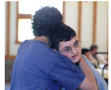
The images shown on this page were taken at the Cohen syndrome meeting.